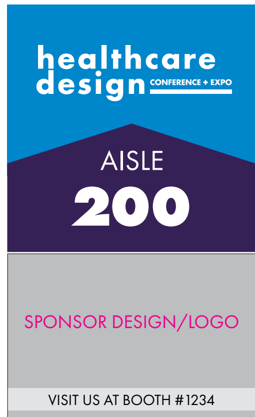
Aisle Cling Example