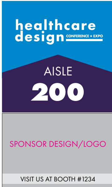
Aisle Cling Example

Placement Options Below – Available on a First-Come, First-Served Basis